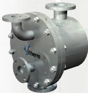
Thermoweld® Plate & Shell Heat Exchangers (without gaskets between plates)

Design Pressure: Vacuum / 100 barg Design Temperature: -50 °C / 900 °C